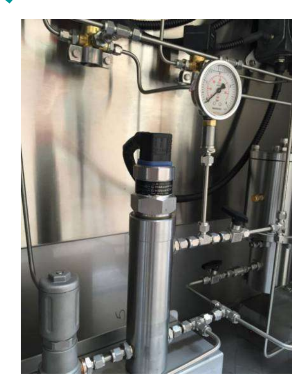
Visit us at www.daggaz.com

Dağgaz Verometer measures quantity of odorant that flows inside of itself.