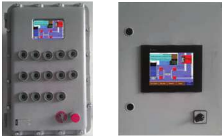
d class explosion-proof or non-explosion-proof controller cabinets