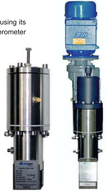
PNEUMATIC or ELECTRIC PUMPS

E M (ETHYL MERCAPTAN) is commonly used odorant for LPG odorization and EMM have very high vapour pressure due to the low boiling point as 35 °C. Hence dosing these kind of liquids generate cavitation problems. Daggaz LPG Odorizers have integrated vapour eliminating system supported with vapour trap and activated carbon filter to remove any odorant vapour trapped inside the pump or tubing; before and after maintenance or before and during operation.