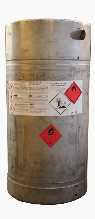
Reusable Odorant Barrel