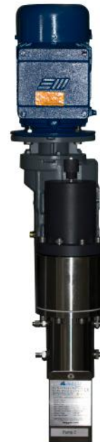
ELECTRIC POSITIVE DISPLACEMENT METERING PUMP